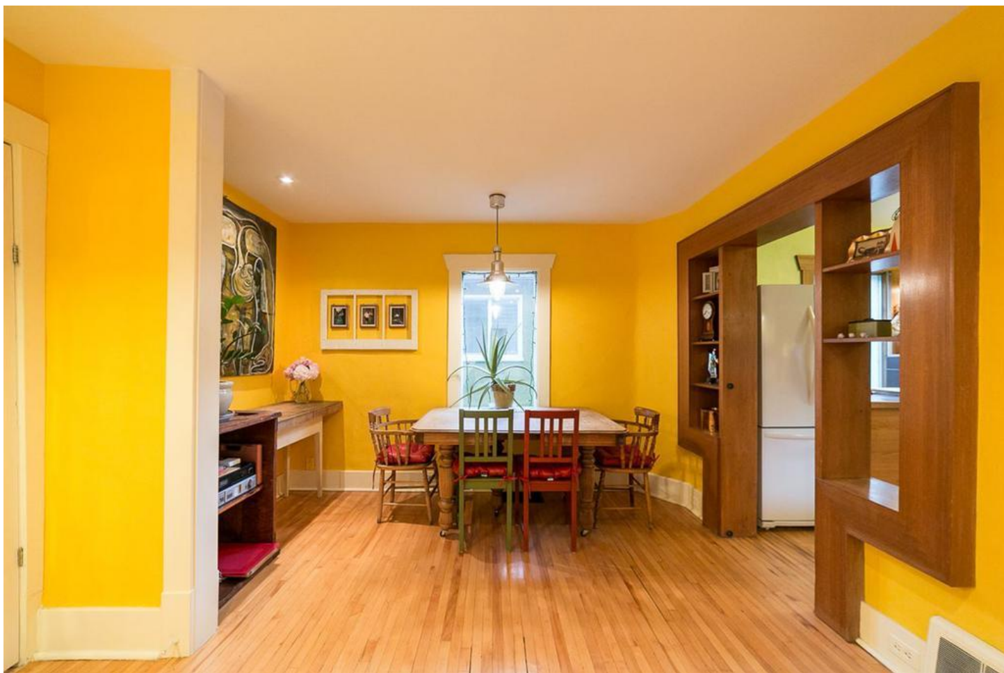
The bright dining room features hardwood accents, including a vintage hardwood floor.