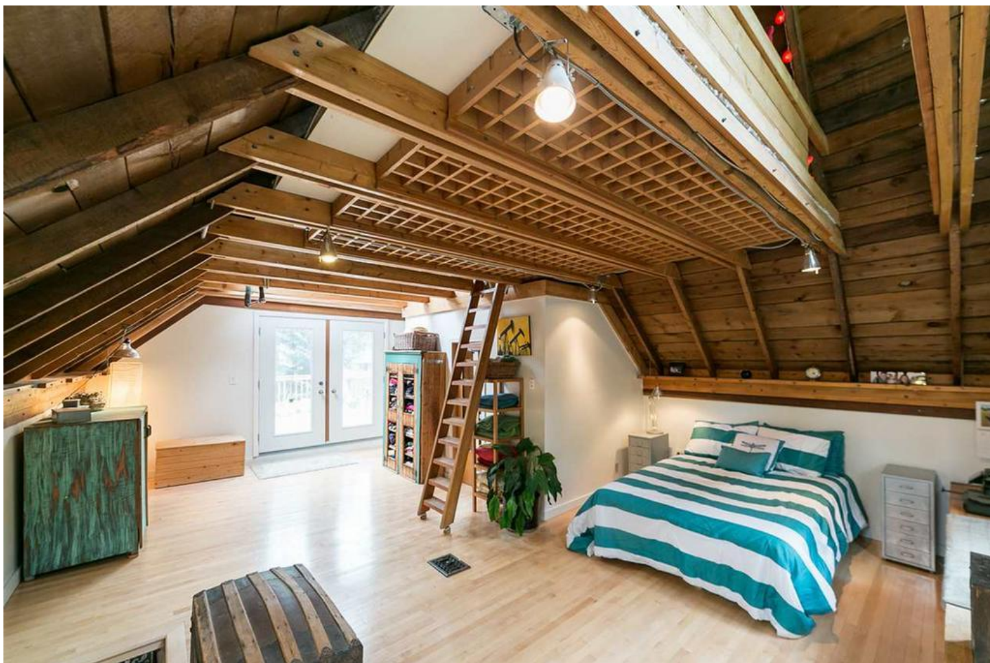
The upstairs loft features incredible vaulted ceilings as well as direct access to the sundeck.