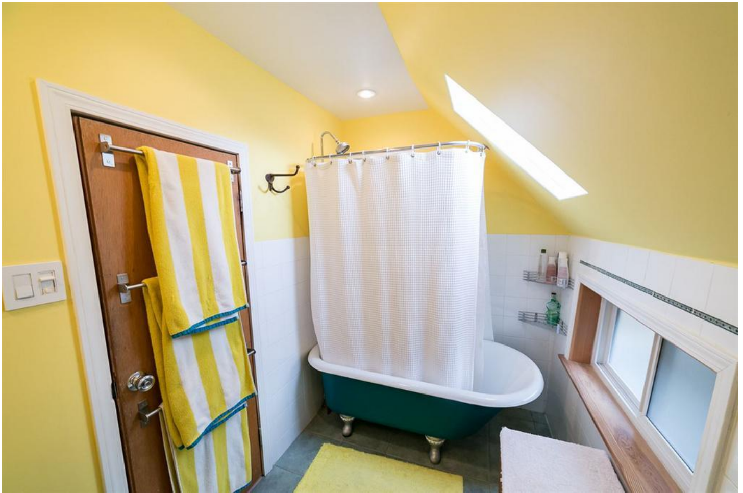
The ensuite bathroom completes the character home with a retro clawfoot tub.